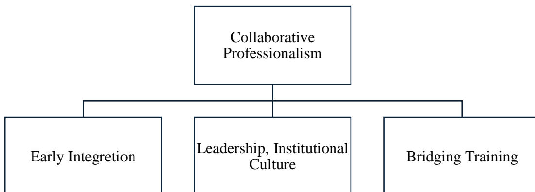
Dimensions of Collaborative Professionalism in Preservice Teacher Education